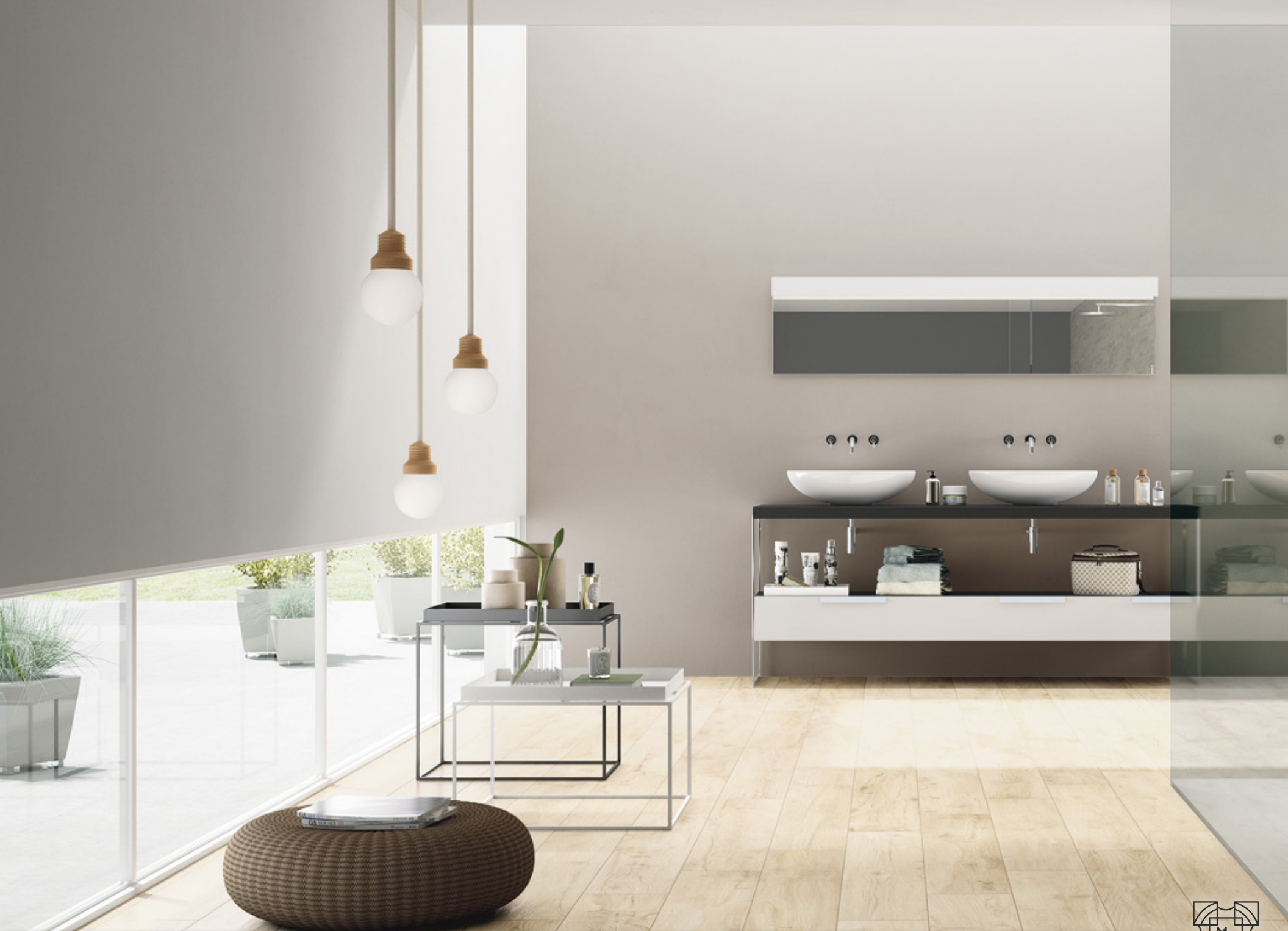
Almond | 12"x48"