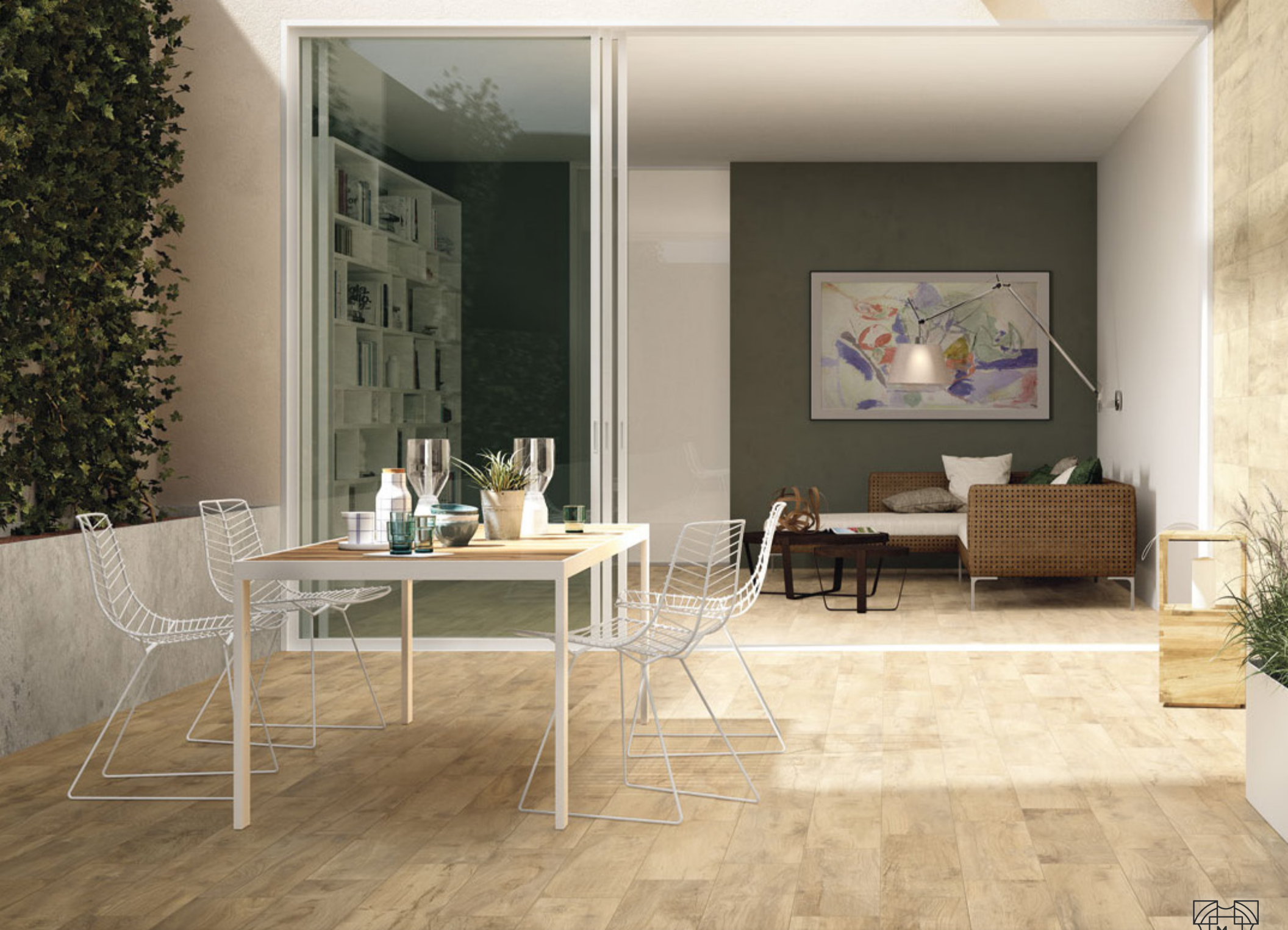
Elm | 12"x48"